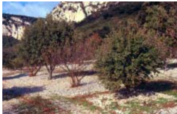
Fig. 4. Black truffle plantation in Navarra. Note the "brûlées" around the trees.