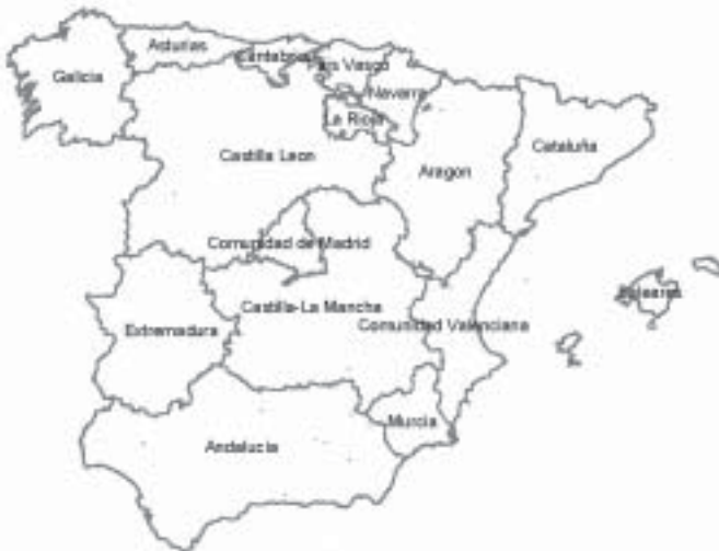
Fig. 1. Map of regions of Spain.

to 30 €/kg, but price does not seem to affect the demand for this product, which steadily increases year after year.