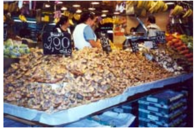
Fig. 2. Stall with plenty of Lactarius deliciosus for sale at La Boquería market in Barcelona.

in order to find out more data on the amounts of wild edible fungi marketed in Spain, it is obvious that the collection and marketing of this non-timber forest product is an enjoyable and profitable task which falls within the concept of sustainable development, and it can be an extremely important source of income in rural areas with few other economic possibilities.