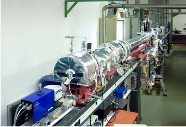
Figure 1: High-pressure shock tube