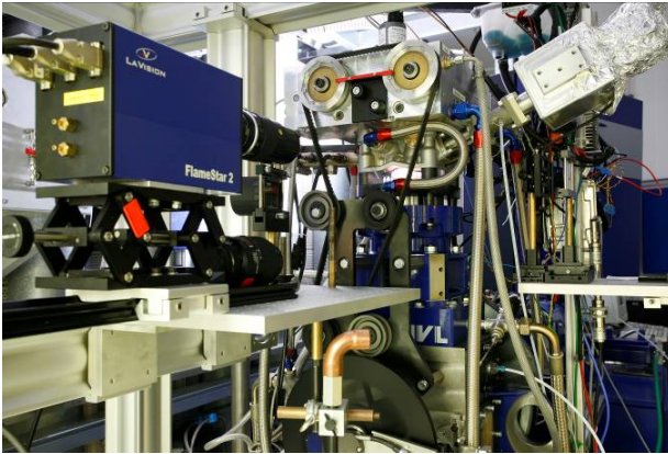
Figure 1: 'Optical IC engine' with diagnostic equipment