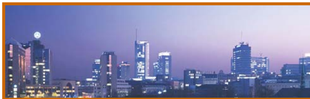
The City of Essen

The conference is supported by the German Ministry of Science and Technology and the Ukrainian Academy of Sciences.