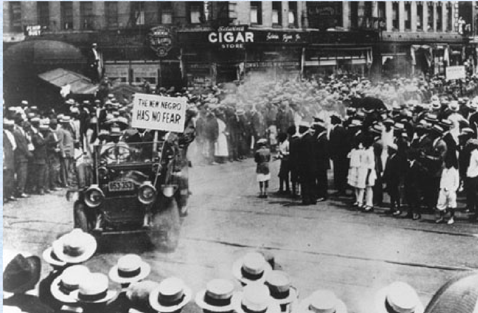
"The New Negro Has No Fear" — supporters of Marcus Garvey parade in Harlem during the U.N.I.A. convention in 1920.