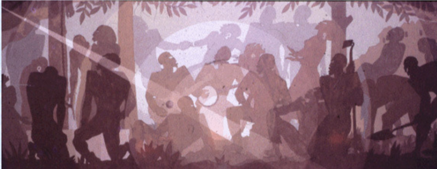
Aaron Douglas, "Idylls of the Deep South" (1934)