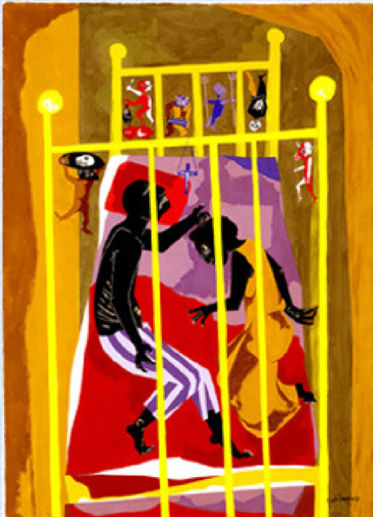
Jacob Lawrence, "Dreams"