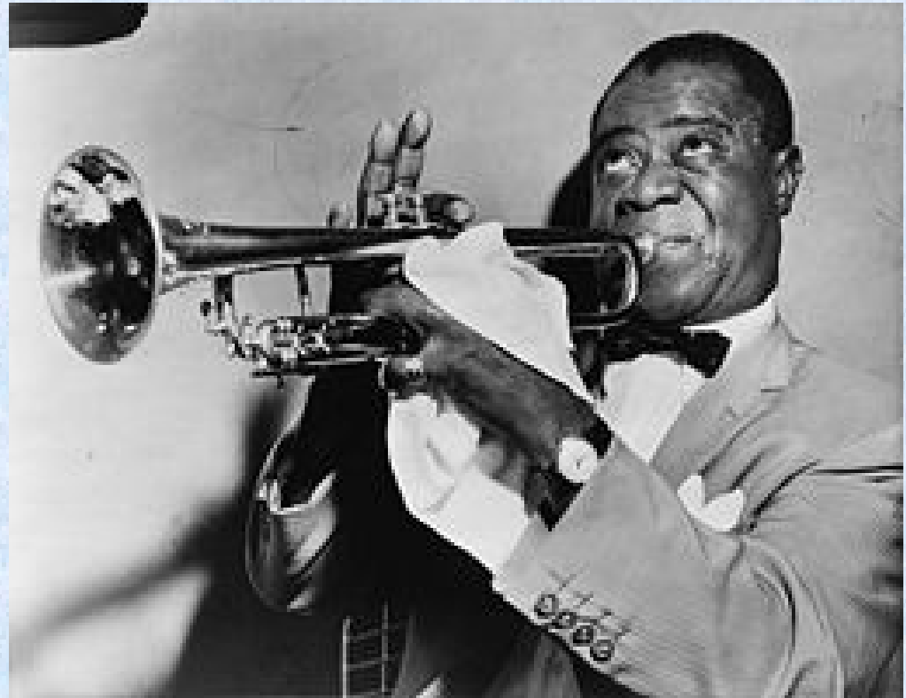
Louis Armstrong (1901 - 1971), known as “Satchmo” or as “the Ambassador of Jazz”