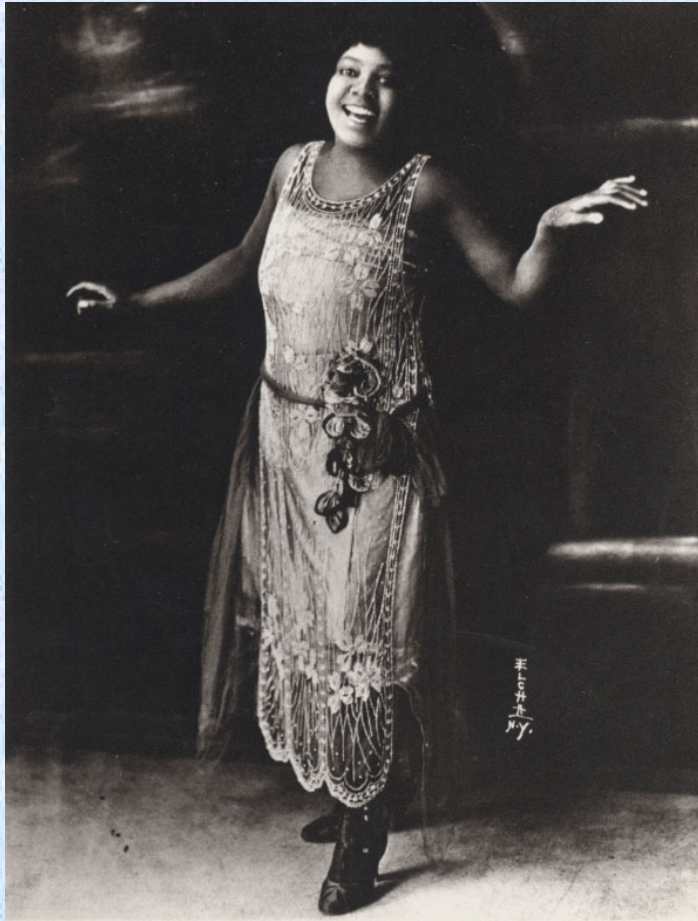
Bessie Smith (1894 - 1937), known as “the Empress of the Blues”