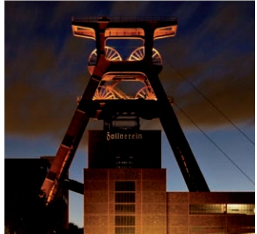
Zeche Zollverein, Essen

Duisburg is a city of many faces, with everything from industrial heritage, parks and local recreational areas to cultural attractions and sporting highlights. The signs of the