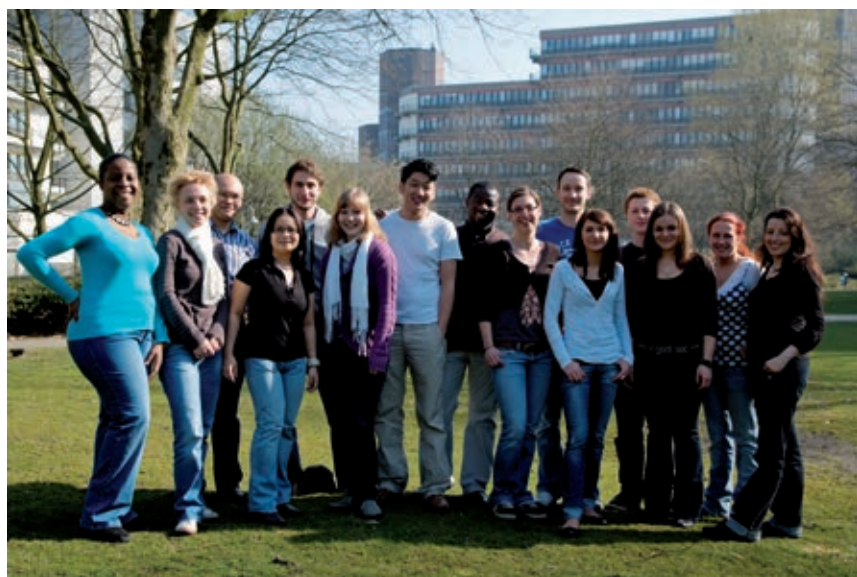
The TSC team at the University of Duisburg-Essen

The TSC tutors help international students with questions on studying, social matters and life in the Ruhr region and at the University. They see themselves as a communication platform for international and German students, for example at the international “Stammtisch” meetings.