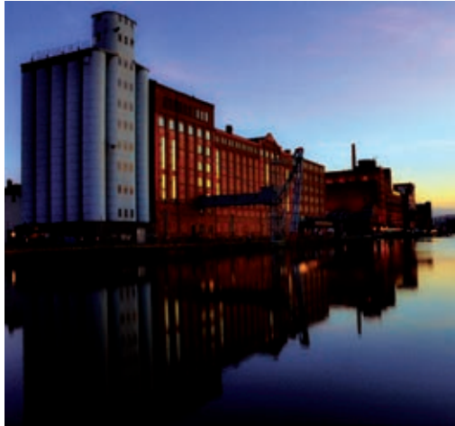
Duisburg's inner port