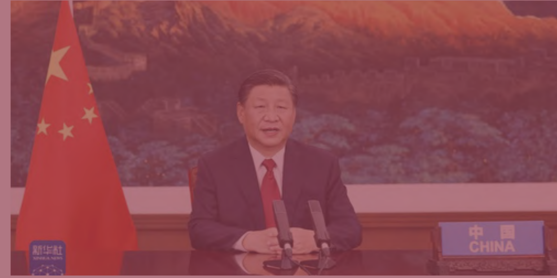
Xi at the UN General Assembly, Sep. 21, 2021