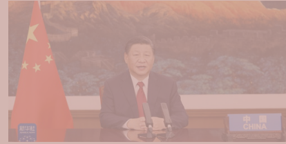
Xi at the UN General Assembly, Sep. 21, 2021