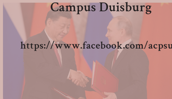
Friendship without limits between master and servant.

Thursday-Saturday, 12-14 October 2023 University of Duisburg-Essen