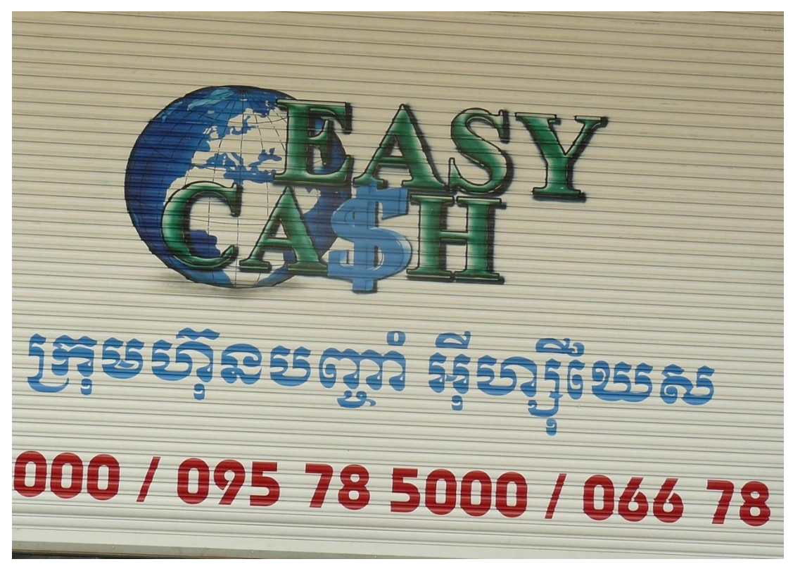
Figure 13: A key issue of the Cambodian MFI / banking system is the easy access to loans, i.e. "easy cash".

⇒ Adapted regulation for the financing of cooperatives would give agricultural enterprises the possibility to have an adapted and more favourable credit offer.