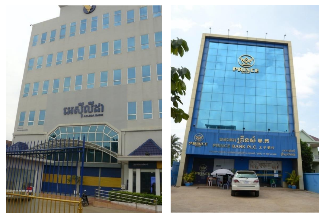
Fig. 8 and 9: New MFIs and bank buildings dominate the landscape in many places, at least as far as newer and modern buildings are concerned.

The possibilities of over-indebtedness are therefore numerous. There are many self-inflicted cases: a recognisable economic miscalculation, acting as a guarantor for third parties without being economically qualified to do so, incurring expenses that cannot possibly be paid with one's income without additional sources, and so on.