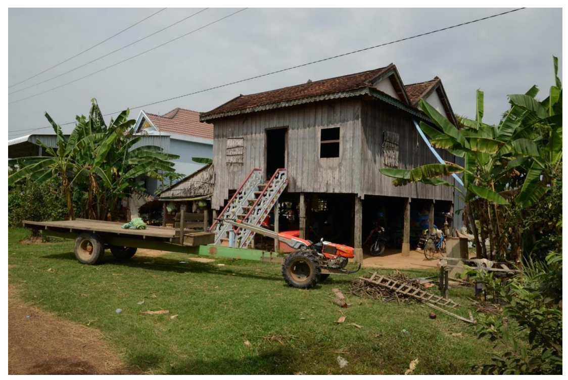
Fig. 10: A house in a village in northern Cambodia that is neither poor nor particularly good in terms of standard, similar to those seen for about 50% of the families visited as part of the hh survey. In the foreground there is a kuyūn, which is being used here as a "small truck".

Since 2019, FIAN and the Cambodian NGOs have specifically formulated the following demands, directed at MFIs among others: (i) a right to debt relief and (ii) the return of land titles "confiscated" in the context of MF. Generally, (iii) MFIs should not be allowed to take land titles as collateral for new loans, also from an international perspective. (iv) The pressure on borrowers to sell land to repay loans should be stopped. The Cambodian government is being asked to work with MFIs and their shareholders to launch a debt relief programme to reduce the number of land sales. Another important recommendation is that the government and international development community should create the legal basis and infrastructure for MFIs to be replaced in the long term by a system of "community- and member-owned local financial institutions" (LICADHO 2019: 15).