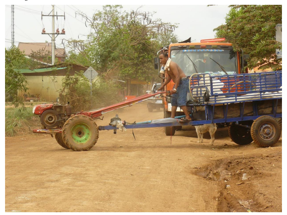
Fig. 6: Loans with terms of one to two years are needed to purchase the hand tractor (also in the "construction kit" for this "small truck"). The cost ranges from US$1,500 to US$3,500, depending on the range of accessories.

Cambodian borrowers have significantly fewer problems planning ahead for their financial burdens than borrowers in countries with unstable currencies and high inflation rates, because of the extensive pegging of the Riel to the US dollar. This saves them from having loans taken out in US$ but paid out in local currency, which are to be repaid in local currency but at current US dollar exchange rates at the end. This is currently the case in Turkey and means that such loans become more than 75% more expensive than at the time the contract was concluded. For example, since 2013, Riel exchange rates have consistently ranged from an initial 4,037 to the current 4,080 Riel per US dollar, while inflation has generally only been around 3% or less.