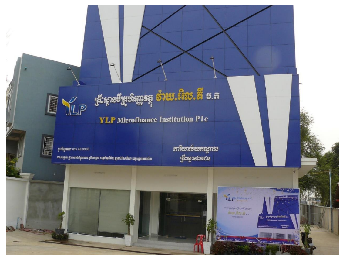
Fig. 1: Even in the smallest urban centres in Cambodia, there are often a dozen different banks and MFIs present.

The study was also conducted with regard to additional issues that may be associated with the impact of the COVID-19 pandemic on borrowers. The study, with the key questions raised, is also understood to be complementary to recent studies that have focused on the relationship between credit and land (Microfinance Centre 2017 and the unpublished KfW / MIFA 2021/2022 study). In addition, other research was evaluated that, in addition to reaching rural areas of Cambodia, has its focus also and especially on urban areas and in particular Phnom Penh, where the COVID-19 crisis, for example, forced more people than in rural areas to take out loans, especially to finance livelihoods (Murg 2021, EU 2021).