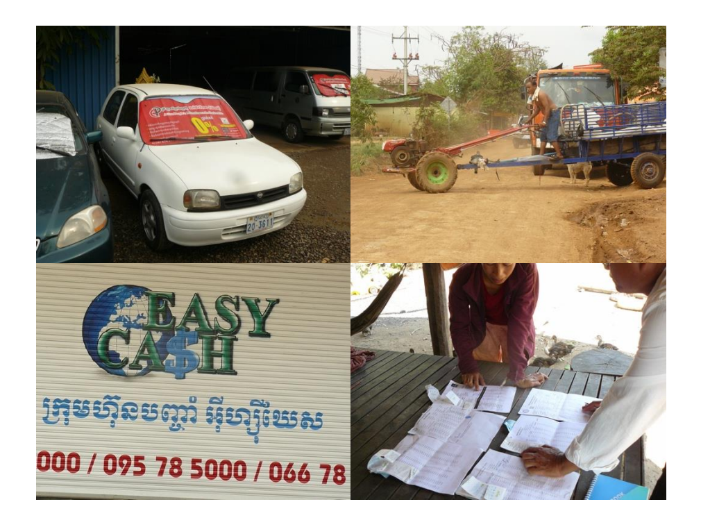
AVE Study 30/2022 Ways out of poverty, vulnerability and food insecurity

Development, Challenges and Recommendations