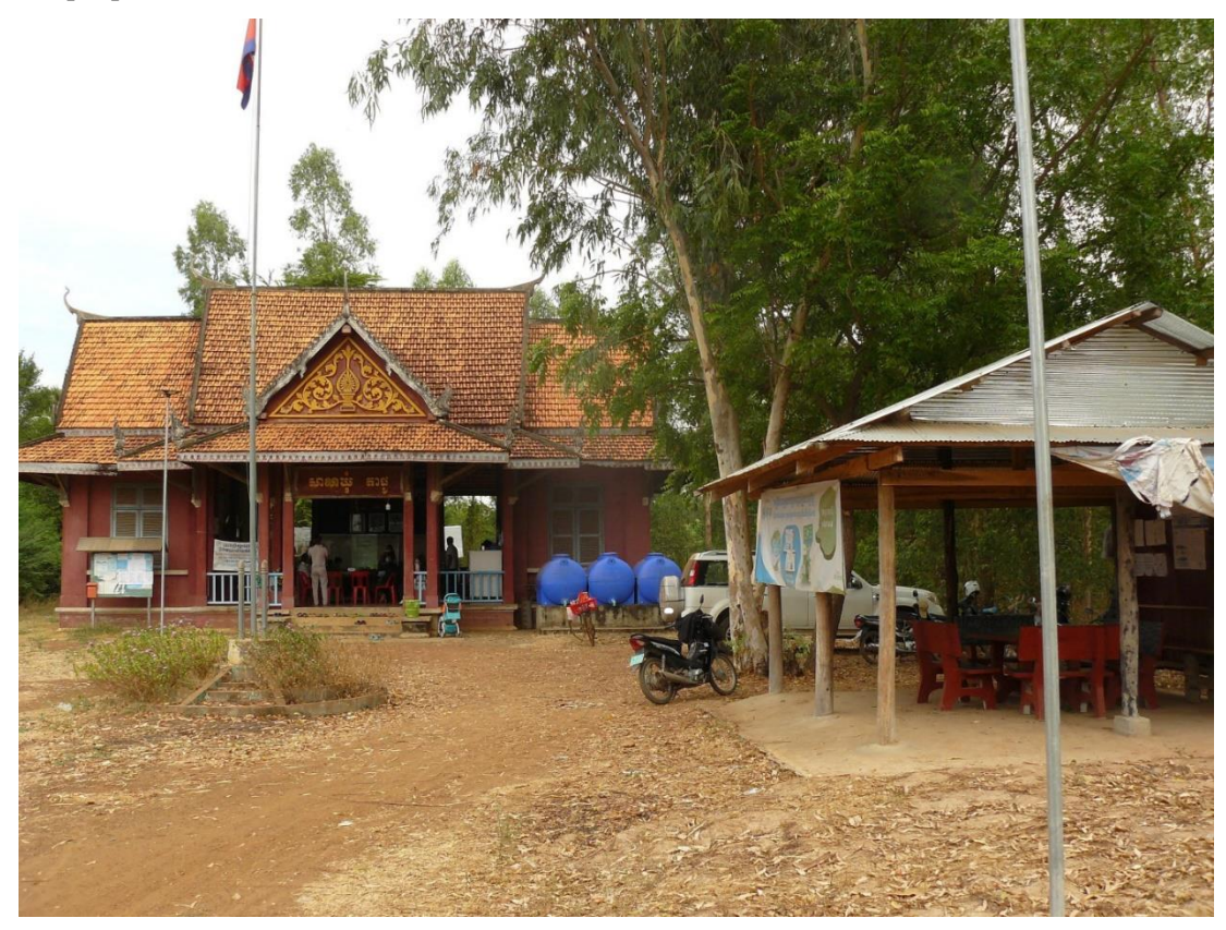
Fig. 5: Typical commune administration building, as constructed under an ADB programme in all six sample provinces.

The first interim results of the research were discussed with various stakeholders during the field phase in Cambodia and then, after the hh surveys were completed, in a second round with the BMZ, participating implementing organizations and representatives of one of the MF funds that continues to be involved with German funding. The author also had policy discussions in Cambodia with several representatives of MFIs and bank management about the MFI sector and FI practices.