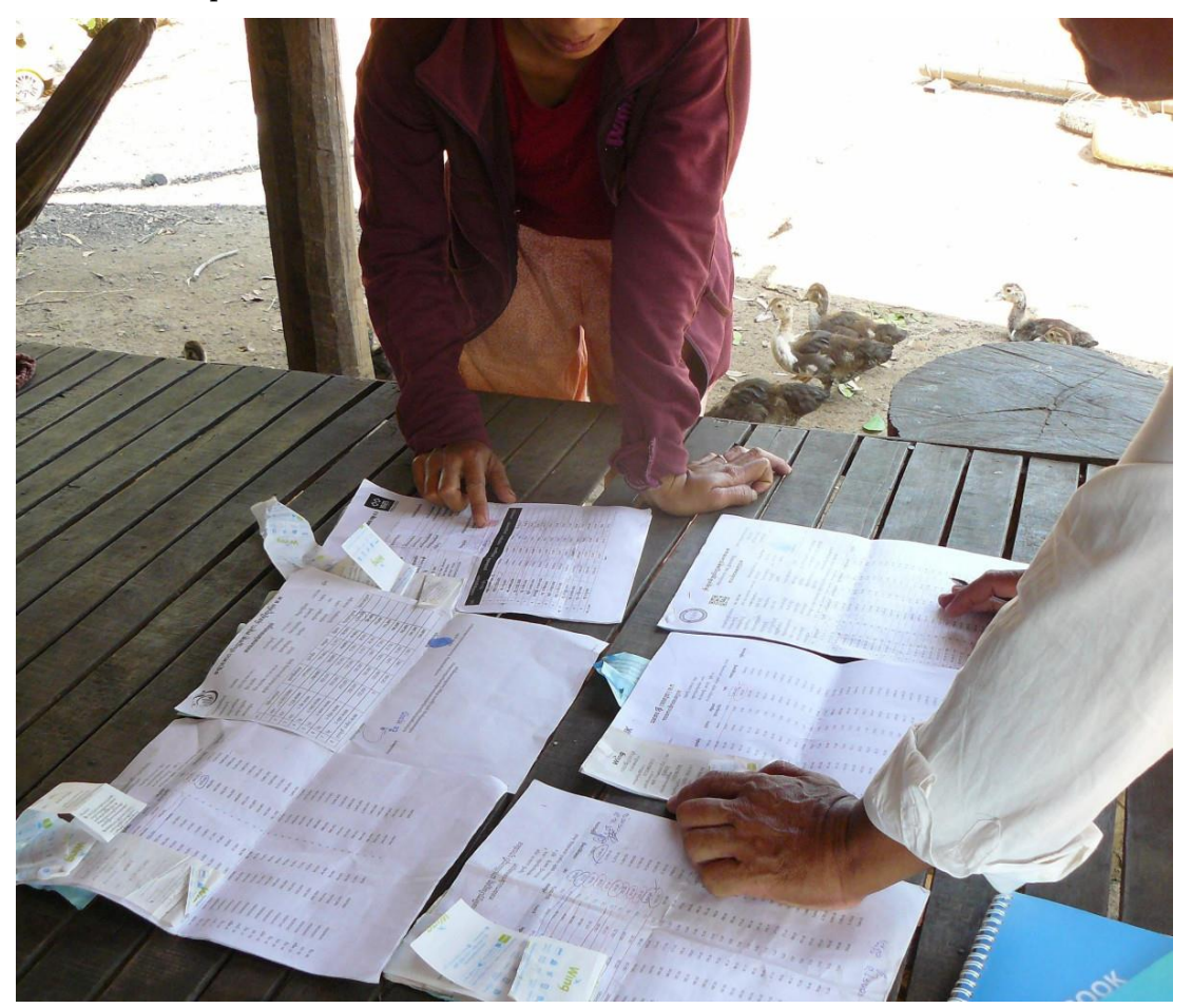
Fig. 7: Five of the six repayment schedules of this debtor, who borrowed about US$10,000 to buy a used truck, comply with the CMA rules (dates, repayment contribution, remaining debt are clearly indicated on the printouts).

Formal FSPs also see their function as being a correction to the traditional lending market. ACLEDA Bank was also supported by German DC in its important function of being a fair and much cheaper alternative to private money lenders and their sometimes oppressive conditions. Since private loans have to be resorted to again and again in order to repay formal loans on time – and thus to maintain creditworthiness with MFIs / banks – this function has lost some of its credibility. This is always the case when a debtor, despite unclear or even insufficient cash flow, gets an additional loan for loan repayment. Here, the business with the money lenders is virtually pre-programmed.