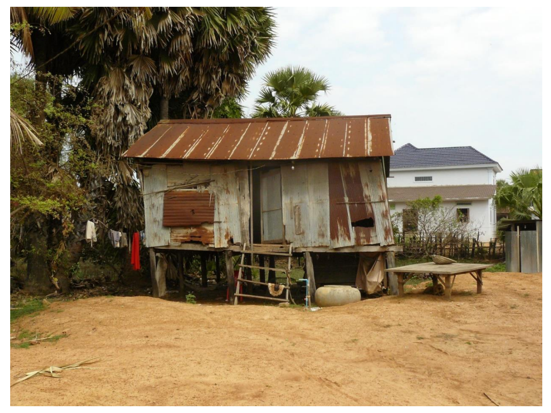
Fig. 2: House of an extremely poor family (with ID Poor status) in a village in Battambang province. The land was provided free of charge by relatives in this case, as in 3.2% of the cases in our study.

A recent study by Symbiotics cites concrete income data for workers in Cambodia. According to this, in 2019, in a sample of 293 respondents, the average monthly income was US$867 / ppp. The GDP contribution was US$360 p.c. / p.m. at the same time (2020b: 24). In a more realistic calculation of ppp, this figure in US dollars is likely to be half of the values given, with average incomes in rural areas and for primarily agriculturally oriented hh being significantly lower again (cf. KoC.NIS 2020: 109ff). A better insight into real wages is provided by the government-imposed minimum income, which was set at a Riel equivalent of US$194 from 01 January 2022<sup>11</sup>. Few of the workers, especially the factory workers who are predominantly