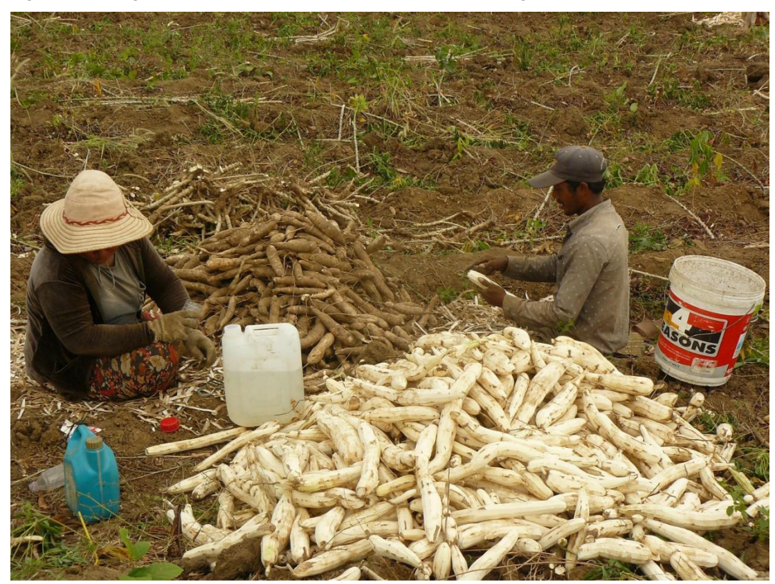
Fig. 3: Processing of cassava / manioc after harvest; most of the sale goes to Vietnam as cattle feed.

Another factor responsible for the persistent poverty and high vulnerability of families that are not explicitly poor is the susceptibility of agriculture to extreme weather events such as prolonged droughts or floods, which causes considerable fluctuations in annual harvests and corresponding incomes. Climate change could further exacerbate the consequences of extreme weather events<sup>16</sup>. This has implications for medium-term financial commitments, for example through loans.