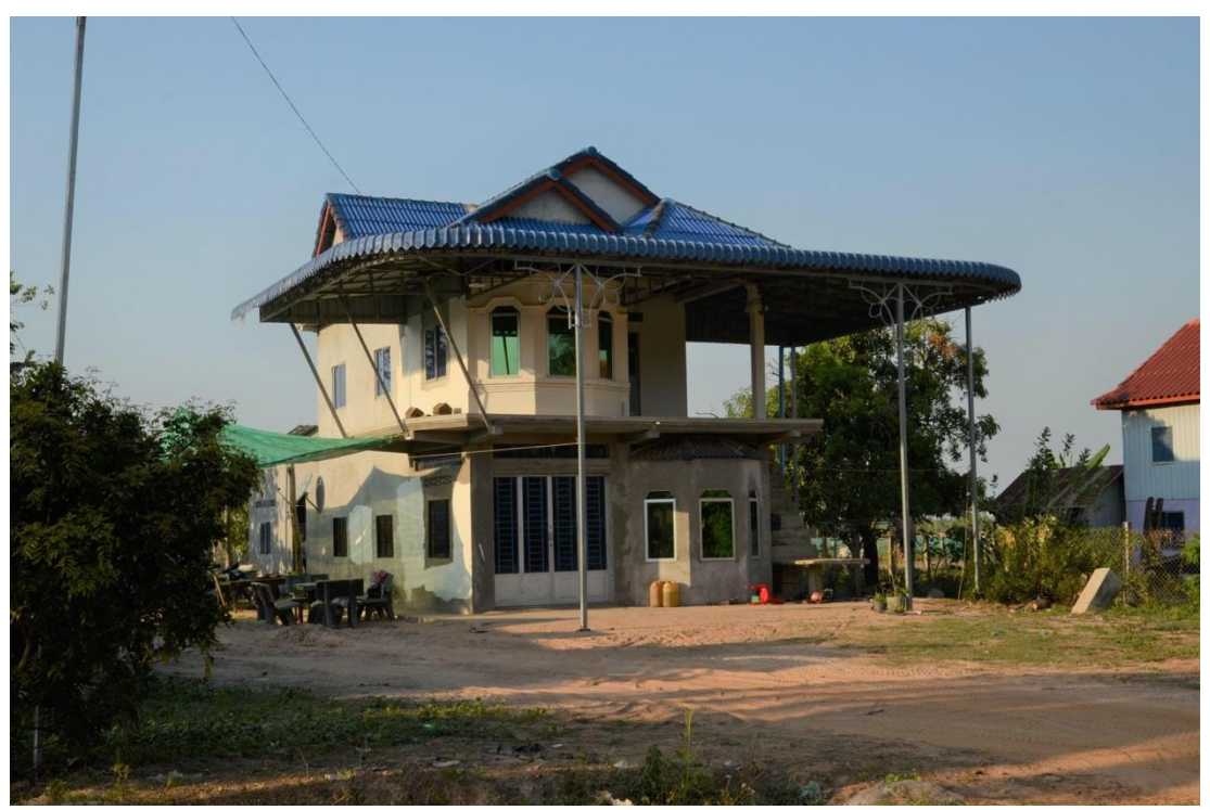
Fig. 12: The somewhat futuristic-looking new construction of a residential building, for which a long-term loan was taken out at more favourable conditions (10% instead of 18% interest rate).

The majority of hh with current loans rate the effects of the loans on their living situation as positive. Of 761 respondents, 93 (12.2%) were very positive about the impact of their main loan, 173 (22.7%) were positive and 361 (47.4%) were somewhat positive. Together, therefore, 82.3% are satisfied with the effects of this loan taken out. Conversely, 23 (3%) refer to very negative effects, 24 (3.2%) to negative effects and 76 (10%) to somewhat or rather negative effects (Table 41). Alongside the 82.3% predominantly positive effects, there are therefore 16.2% predominantly negative effects. At least 31.7% of hh have problems with repayment. However, the group which sees the results of borrowing (so far – because we are talking about current loans) as negative is only half of this size.