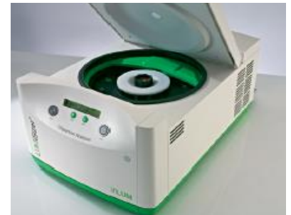
Fig 2: Analytical centrifuge