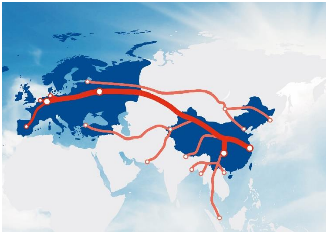
Image Description: Routes of China's New Silk Road