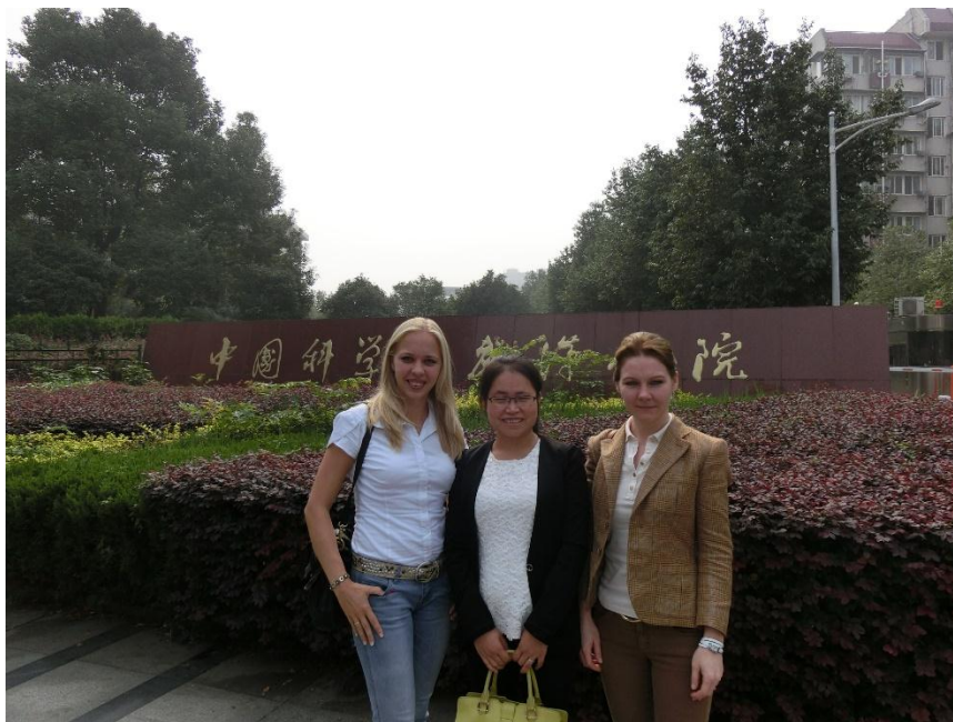
Campus of Wuhan University

The group of Prof Huimin Yan are focused on the investigation of Flagellin biomolecules, which are known as potent immune activators by bridging innate inflammatory responses and adaptive immunity and an adjuvant candidate for clinical application. The aim of our joint project is to prepare flagellin-functionalized calcium phosphate nanoparticles and to test their immunostimulatory effect on the innate immune system. During our visit we could discuss the latest results and develop the new ideas.