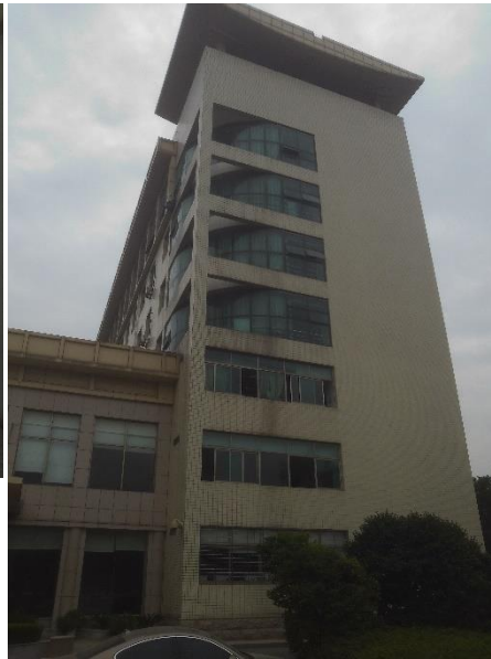
Figure 5: Institute for Virology in Wuhan