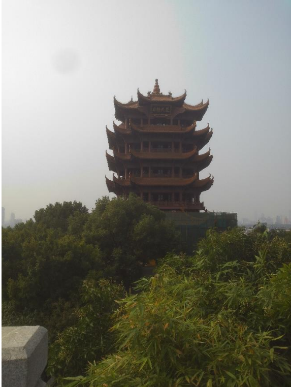
Figure 2: Yellow crane tower in Wuhan