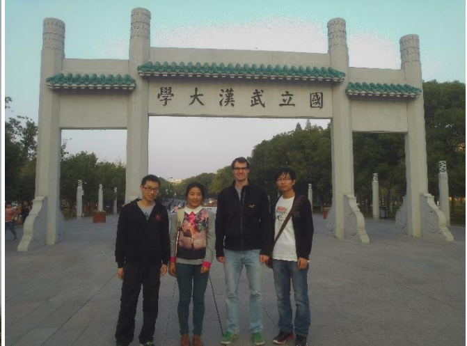
Figure 3: Gate of Wuhan University