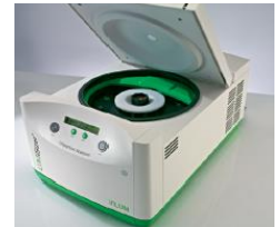
Figure 1b: Analytical centrifuge